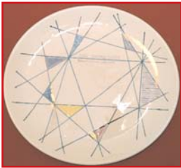
left - Award Platter