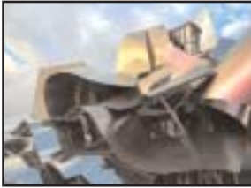
above: Frank Gehry treads the light fantastic for Marquis de Riscal. Right: Zaha Hadid's tasting room for the Heredia Winery - complete with art nouveau boutique.